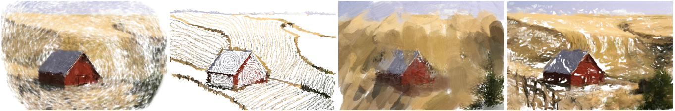
Figure 6. An example of the diversity of final results obtained by different users from the same reference image.