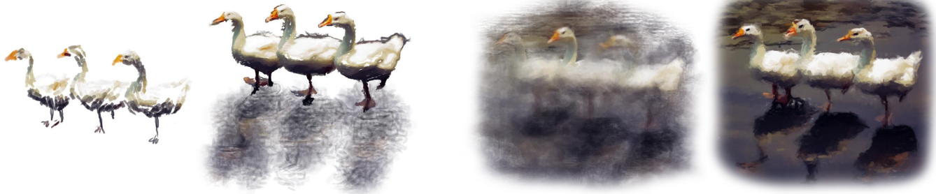
Figure 1. Several examples of geese painted by novice users with Painting with Bob in under ten minutes.