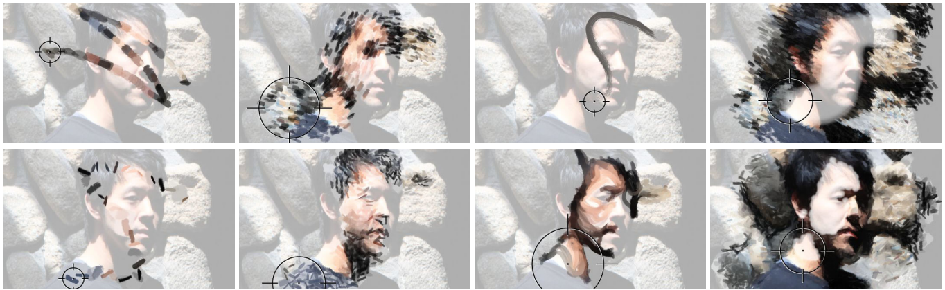
Figure 3. Examples of a single user interaction. Top: Simple tools. Bottom: Smart tools. From left-to-right: Single, Fill, Structure, and Eraser