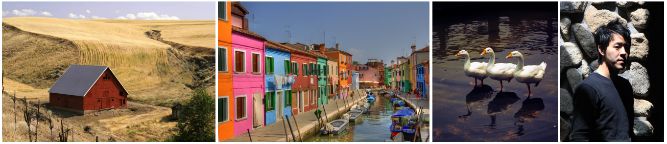
Figure 5. The four input images 1 for the user study. Each user painted three of these images.