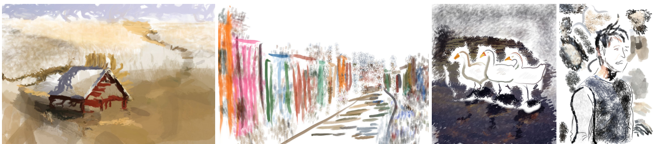
Figure 8. Four “failure” results, where the user was not able to exploit the system to reach the intended completion of the painting.