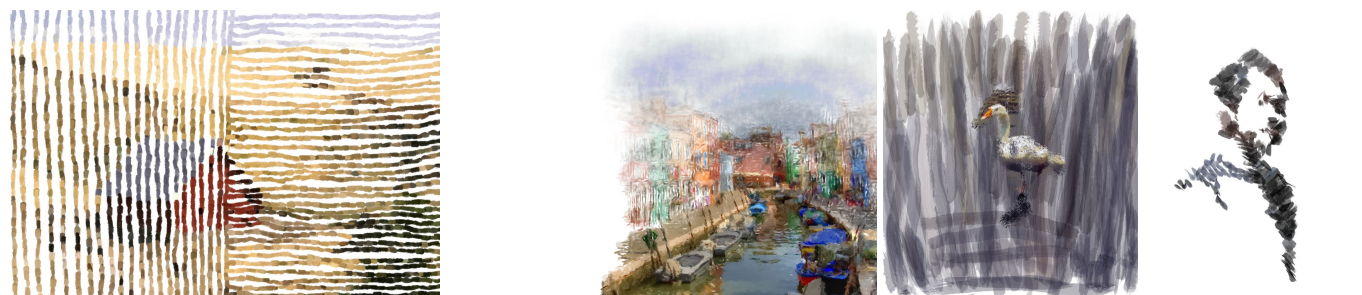
Figure 9. Four “creative” interesting results, where the user has been able to express a unique personal style.