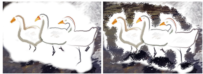
Figure 4. (Left): Foreground elements (geese) drawn first; (Right): Attempts to fill in background (space between geese) results in irregular background and noticeable seams between foreground and background.

While we instructed users in the use of the UI, we did not advise them on any painting related strategies. Consequently, when coding the users’ log files we observed a number of common painting technique challenges, along with tech-