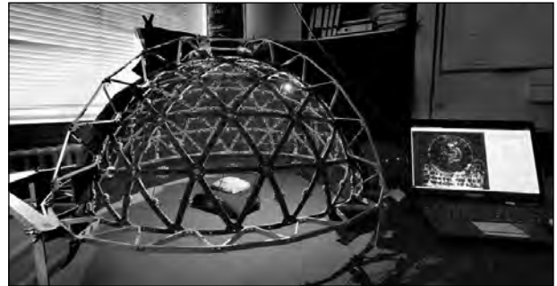
Figure 2. Minidome from the University of Leuven used for the RTI acquisition.

WebGL (Khronos Group 2009) is a library that extends the capability of JavaScript to allow the interactive generation of 3D content within any compatible web browser (Chrome, Firefox, Opera, Safari). The main advantage of WebGL, with respect to the previous solutions for the integration of 3D content in the web, is the absence of external plug-ins