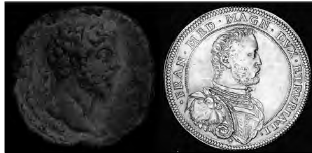
Figure 1. Two example of coins inserted in the kiosk: (Left) a Roman bronze coin; (Right) a modern gold coin.