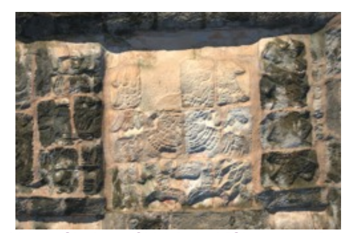
Mayan Glyphs at Chichén Itzá [Glencross08]